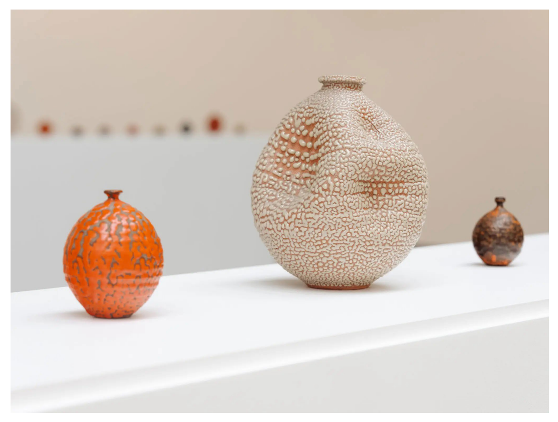
The pots are ravishingly seductive. Some are smooth as river rocks; others are cracked or lumpen, like overripe fruit from otherworldly trees.