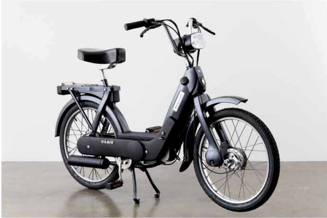
Ciao n°4 (nero) , 2012, restored Piaggio Ciao moped, 51½ by 63 by 28¾ inches.

CARRON With Giacometti, I needed to do those works for myself, because L'Homme qui marche epitomizes existentialist sculpture. But now I'm more interested in forgotten artists, particularly those from the '60s and '70s. These works start with an image and end with an image. Again, the material does not interest me much. My materials are the artists themselves. It's a negation of creativity in a way, because I don't create, I copy.