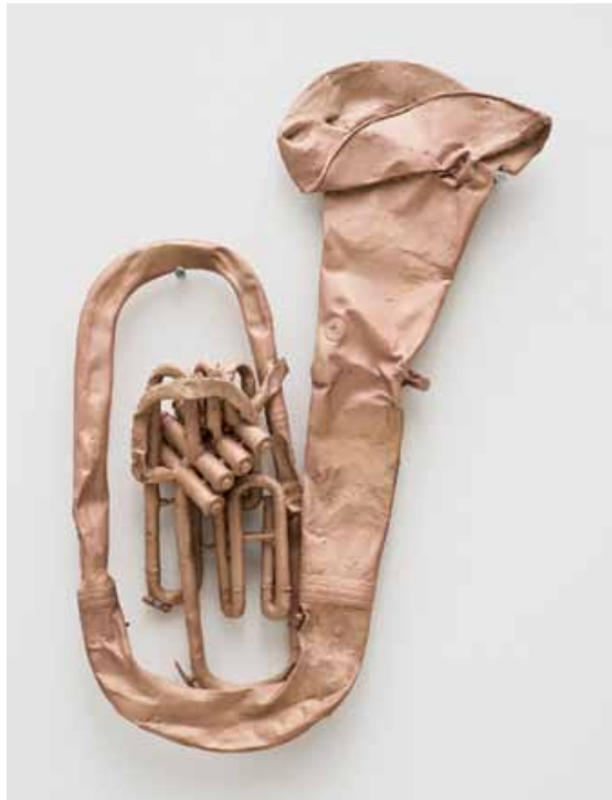
Universal, Alfredo, domino , 2012, cast bronze, 29 3/8 by 20 1/2 by 4 1/2 inches.

CARRON Such materials do give a certain reassurance, but it also seemed logical to me to use them. I thought of doing the instruments in copper, their original material, but I would have found that redundant. With bronze, a rupture is created. I had first encountered crushed instruments as decor in a bistro. I wanted to take this decoration and bring it into the history of art—to add something extra, to bring