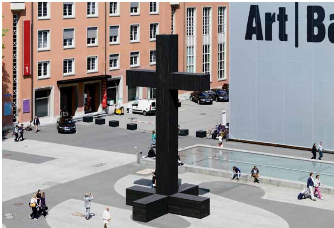
View of Carron's 40-foot-tall painted wood and steel cross at Art Basel, 2009.

AT ART BASEL IN 2009, a black wooden cross nearly 40 feet tall stood outside the main exhibition venue confronting thousands of visitors streaming into the fair who might have found the towering sculpture somewhat puzzling. Was it a public monument that had long been there? Perhaps it was a newly commissioned artwork meant to symbolize the transnational cultural faith that the fair represents or, alternately, to serve as a double-sided critique of Christianity and commerce. Seen from a different angle, it might have appeared more minimalist than religious in nature. As it turned out, the provocative work was a new sculpture by Valentin Carron and was based on the crosses one frequently encounters in the Swiss countryside. The piece exemplified the artist's practice, which centers on sculptural reproduction and often shows how context can affect the perception or meaning of an object.