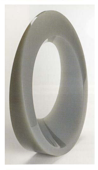
Above: Fred Eversley, Untitled , 1976. Polyester resin, dimensions variable. Right: Cercle d'Art des Travailleurs de Plantation Congolaise, view of exhibition, 2017.