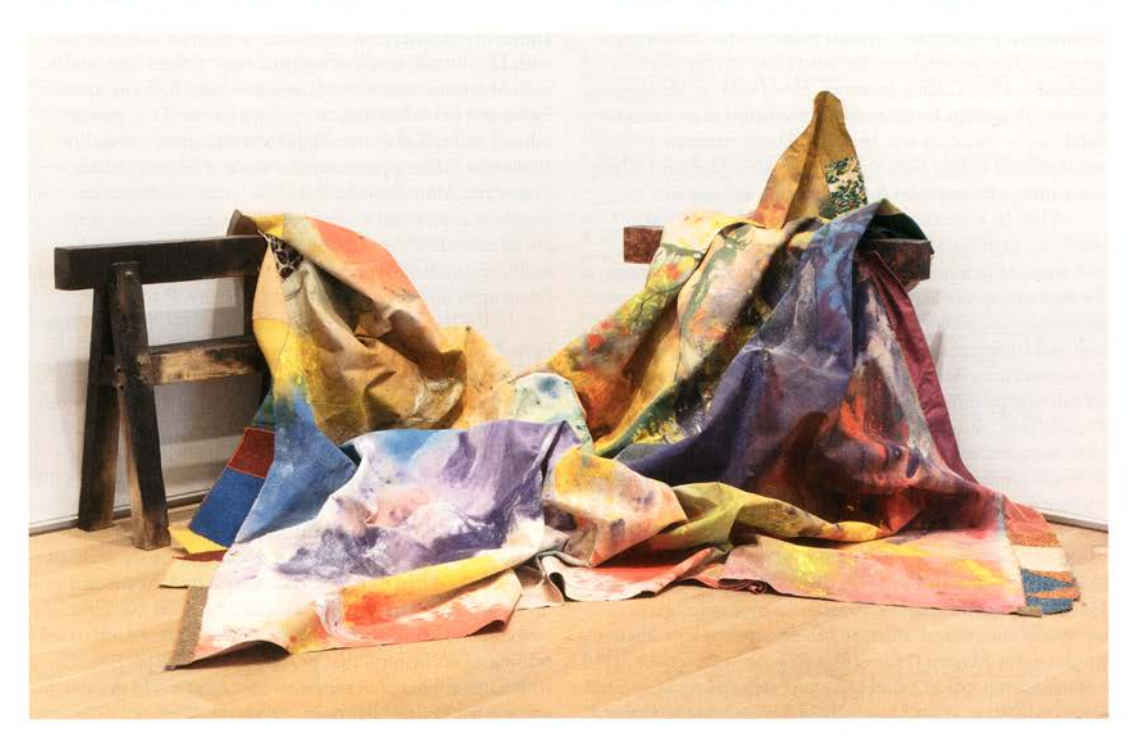
Carpenter I, 1973, acrylic on canvas draped over wooden sawhorses dimensions variable. Art Institute of

After the Corcoran presentation, more museums wanted to show Gilliam's drape paintings. He made ever-larger canvases for projects at the Art Institute of Chicago, the Walker Art Center in Minneapolis, the Baltimore Museum of Art, the San Francisco Museum of Modern Art, MoMA in New York, the Wadsworth Atheneum in Hartford, and the US pavilion (curated by Hopps) at the 1972 Venice Biennale. In 1969, at the