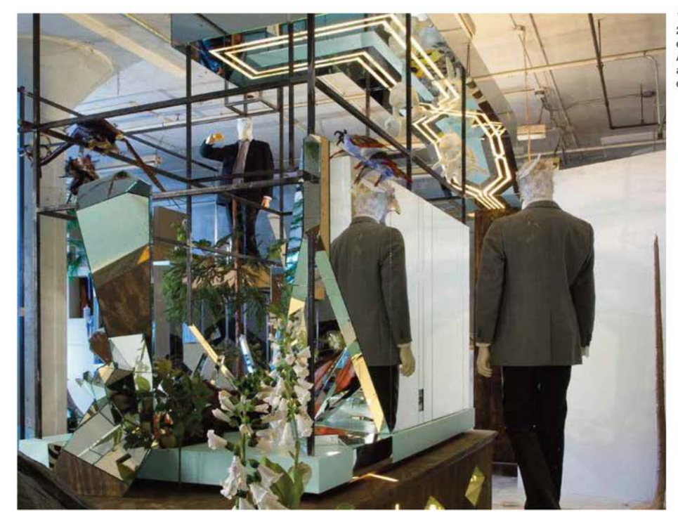
The Index (detail, work in progress), 2007, mixed media, 425 x 915 x 915 cm overall.