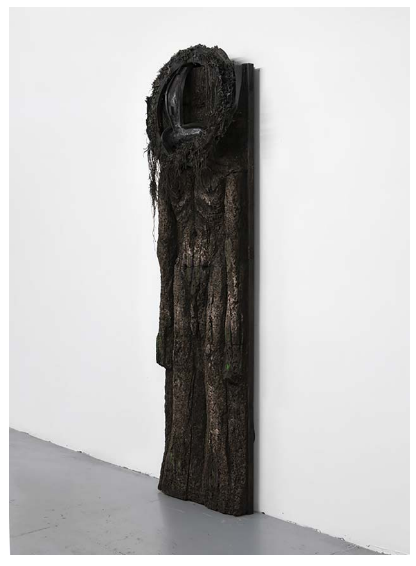
Huma Bhabha, Ground, 2019.

torically, steles, half architecture and half sculpture, are monuments that commemorate the lives of the powerful. Ground also immortalizes a mighty one. The mysterious tall body is carved in high relief against a plain dark background. The artist creates the illusion of depth and spatial recession by forging strong tonal contrast with a combination of undercutting, texturing, and incised lines to sharpen the visibility of the emerging figure in the foreground. The circle of the head is framed with a shredded tire found on the street, and a used rubber mold discarded from the artist's foundry resembles an abstracted face. Recycled objects have always found their way into Bhabha's work, as if she is reclaiming relics that have been rescued from decay and neglect.