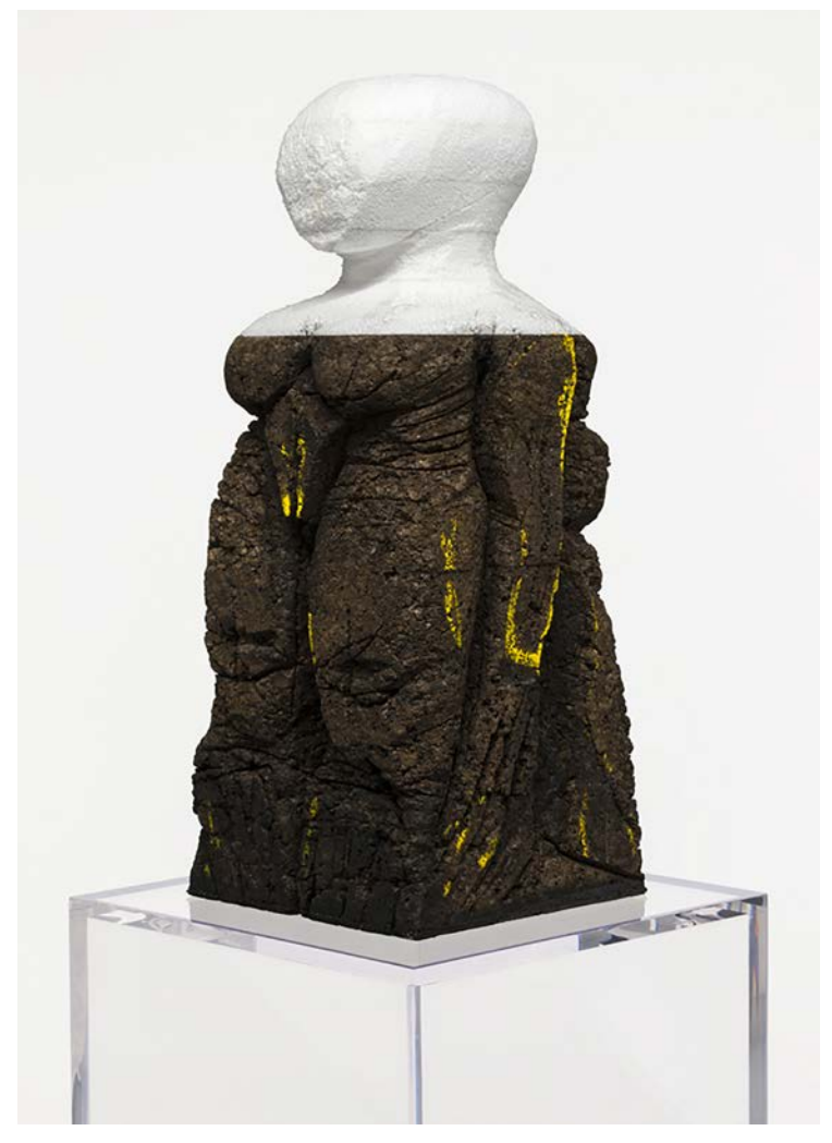
Huma Bhabha, She Has Only Three Paws , 2019.

the floor, emphasizes the representational space, and also underscores the work's transportability and homelessness—the negative condition of the monument, according to Rosalind Krauss. 1