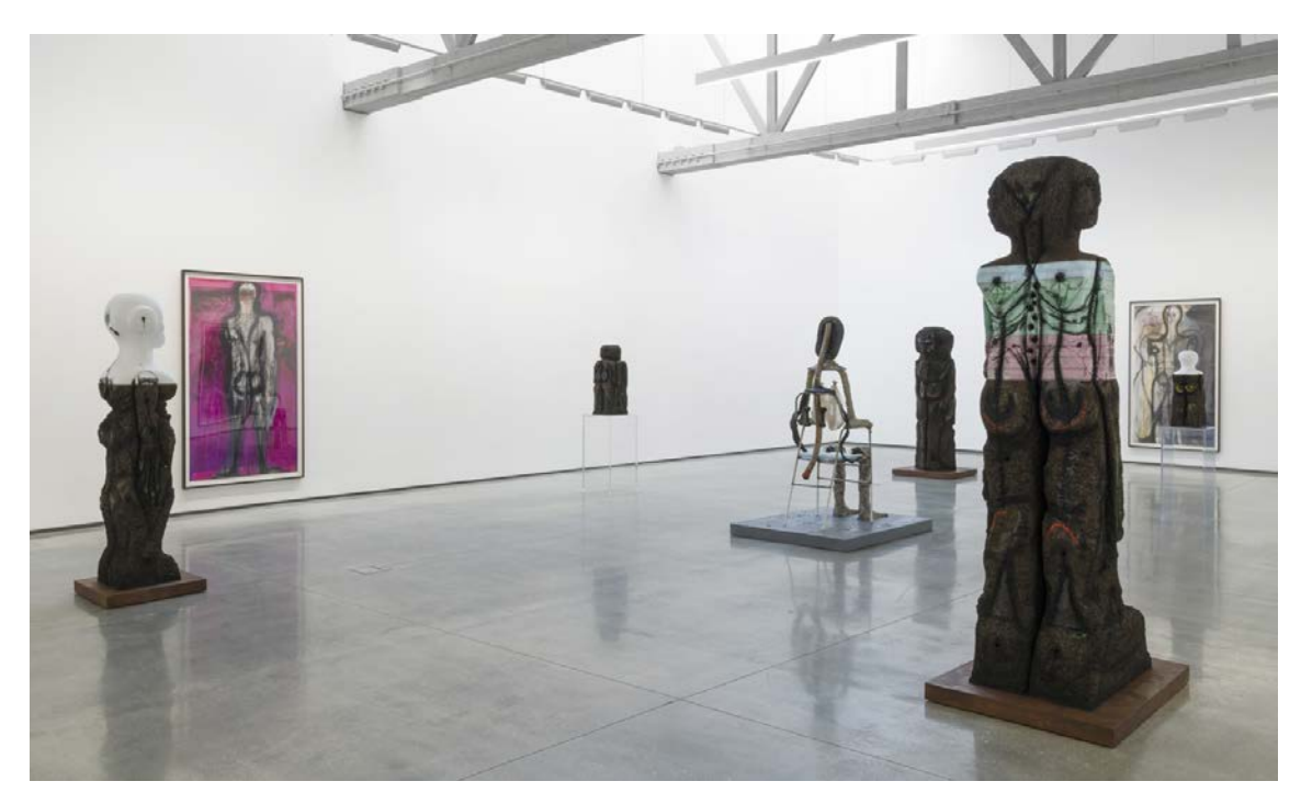
Huma Bhabha, Installation view at David Kordansky Gallery, Los Angeles, 2020.

but highly texturized surface is further cut, scratched, and pitted, as if the phantasmal body, riddled with scars, has been resurrected from a ruin to recount memories of violence and strife in the distant past. Despite the work's formal similarity to the archaic, Bhabha brings the character to life by choosing the materials and vocabulary of our times. Instead of sandstone or marble, she has constructed the initial column with banal, resilient, yet easily adaptable cork and Styrofoam. Cork is always brown and dark, indicating the color of the earth. Styrofoam comes in four light colors: white, pink, blue, and green. The blue reminds the artist of the sky, and the pink the sun. Positioning cork in the lower portion of the column visually grounds the statue, and the celestial colors of the Styrofoam guide the viewer's gaze upward. A narrow, straight gap is cut through between the two stout Doric-column-like legs. This curious new motif is a nod to Barnett Newman's "zip"—a vertical band that crosses the entire pictorial plane as a portal to the sublime.