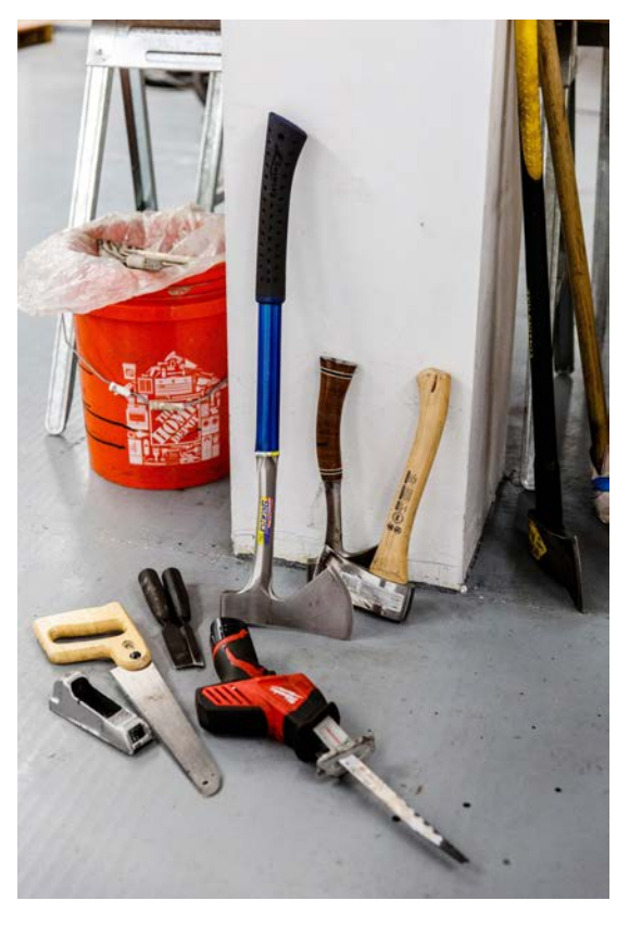
The artist's sculptural practice often produces a lot of dust — she works regularly with wood and cork — so she is ready to clean and start fresh after shipping her new works.