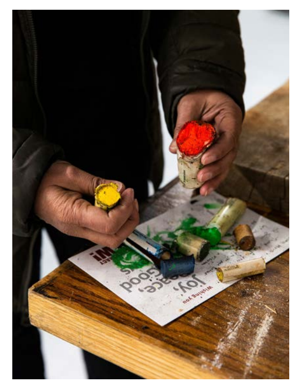
A selection of oil sticks in the artist's studio. Eva Deitch