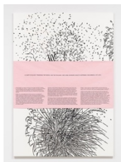
Matthew Brannon War Tourism and Online Activity (II), 2024 acrylic and oil on canvas, with Japanese gampi paper 108 x 76 x 1 1/2 inches (274.3 x 193 x 3.8 cm)