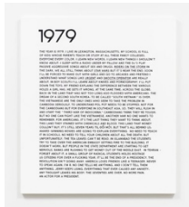
Matthew Brannon and so 1979, 2024 silkscreen and acrylic on canvas 52 x 45 1/2 x 1 1/8 inches (132.1 x 115.6 x 2.9 cm)