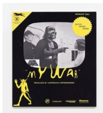
Matthew Brannon My War, 2024 silkscreen and acrylic on canvas 52 x 45 1/2 x 1 1/8 inches (132.1 x 115.6 x 2.9 cm)