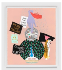
Matthew Brannon Disco Beats, Political Passion, Public Favor & Harvey's Milk, 2024 silkscreen and hand-painted elements on paper 61 x 52 inches (154.9 x 132.1 cm) framed: 64 7/8 x 55 7/8 x 1 5/8 inches (164.8 x 141.9 x 4.1 cm)