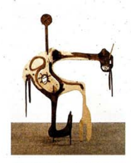
Pierced Line (Brown Goblinoid), 2008