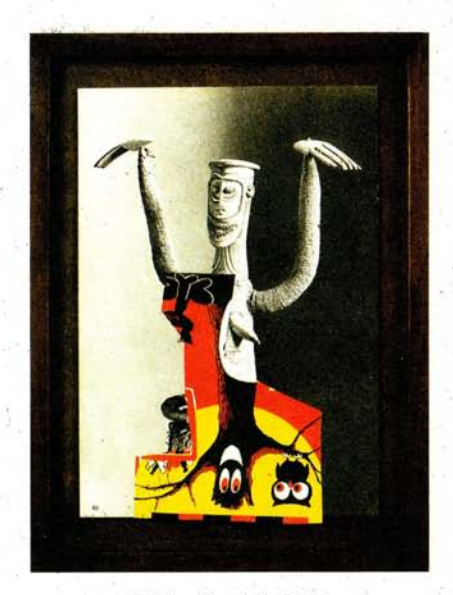
To Fold and Puncture, detail, 2006

The question remains, however, why representations and evocations of the classical were so intrinsically linked to the use of grisaille. (It's taken for granted that the classical period was primarily represented by sculpture, since classical examples of paintings were virtually non-existent through the Renaissance, whereas you still can't dig a hole in the city of Rome without running across a marble arm or leg). Depending on the theological bent of whichever Papal or cardinal patron was doing the patronizing, Renaissance artists were either encouraged to or discouraged from forcing syncretic connections to pagan subjects in their religious pictures. Grisaille became one method (allegory being another) of having potentially subversive and heretical subjects both there and not there, a zone of ambiguity and disputation outside the fully polychromatic Biblical narrative, the "real" story, and intended to mean-according to the sectarian viewpoint of whoever's looking-either that the cult of Attis, for example, is continuous with the story of Christ, or else that all that old heathen stuff crumbled under the weight of a cross.