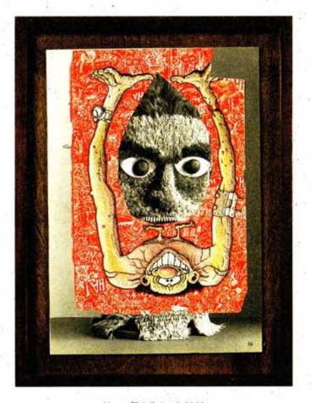
Haunt (Thief), detail, 2006