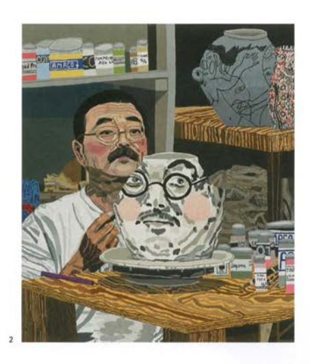
Wood's modernism is a modernism of the screenshot, though it requires neither computer nor camera.