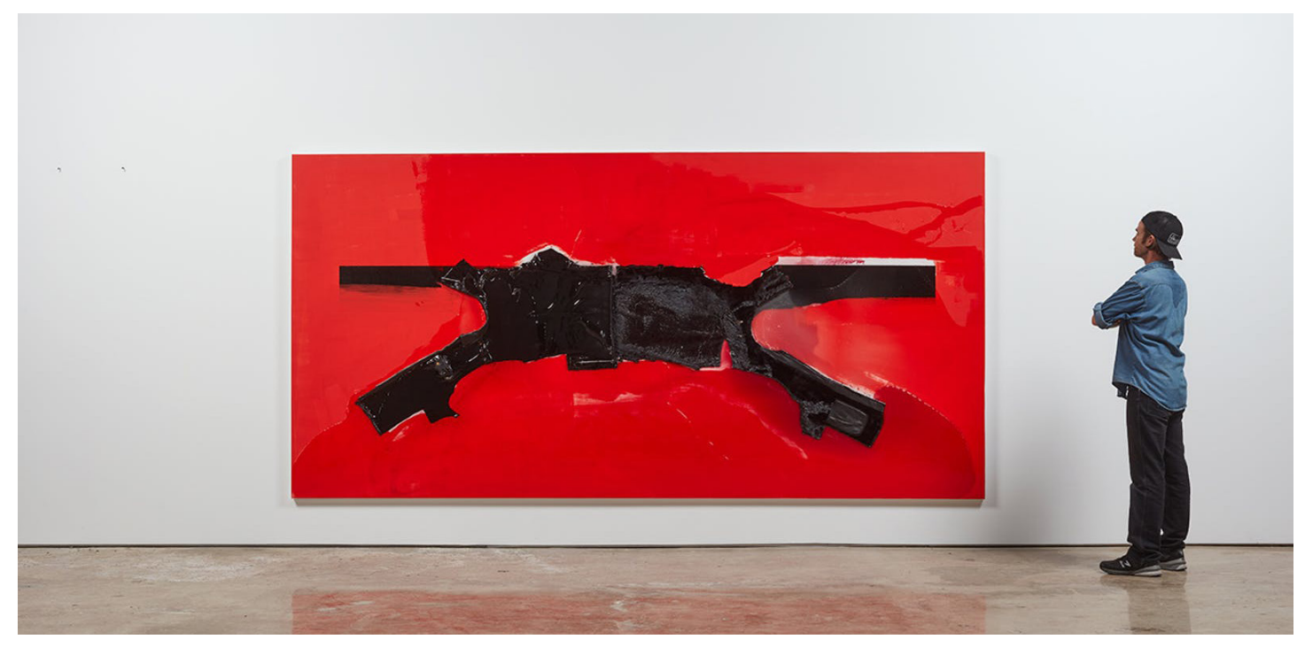
"Lazy X"