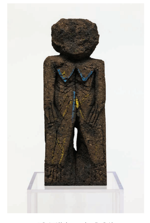
Dailamite Highlander, 2019, cork, acrylic, oil stick and Plexiglas, 173×46×46 cm.