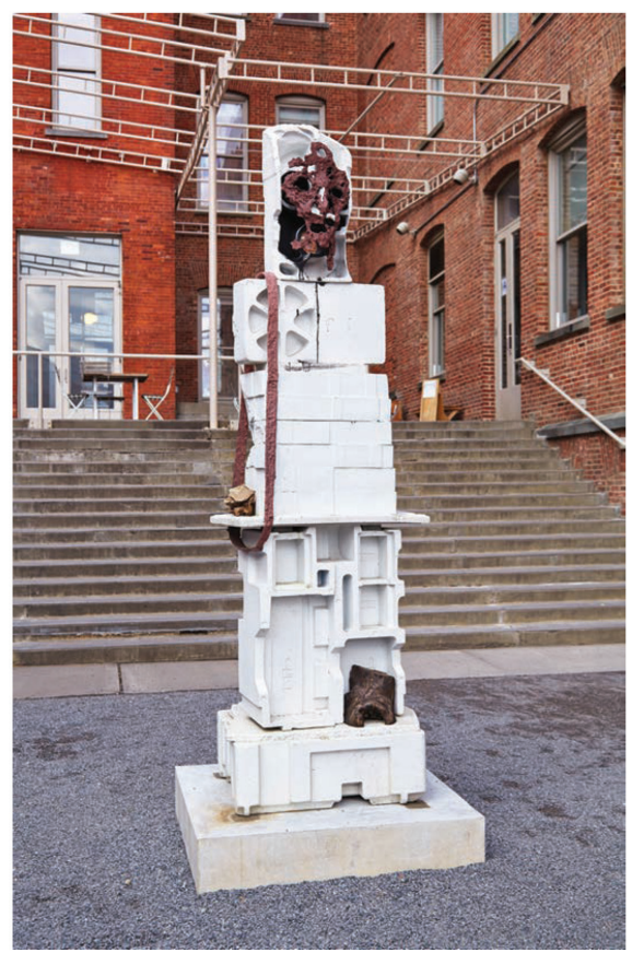
Ghost of Human Kindness, 2011, painted bronze, 263×81×97 cm.

нв Sure. Spirituality and stuff like that.