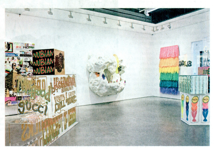
From left, all from 2022: "LODA"; a detail of "thou shall not fold" (on wall); "my hood gucci (nubian)"; two untitled pieces; and "Sons of Watts." Says Halsey: "I've been collecting as long as I could breathe."