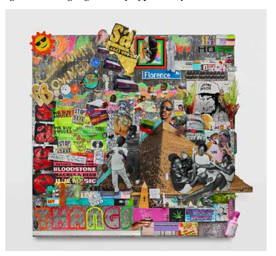
"thou shall not fold," 2022. Art work by Lauren Halsey

In our current art world, the certainty of missing something has become inevitable. One contributing fact is that the connoisseur class, collectors and museum curators alike, insist that the art-fair circuit—essentially a farcically far-flung and fast-paced shopping spree—is a vital context for art. In 2022, galleries schlepped their wares to fairs in Basel, Dubai, Hong Kong, London, Miami, Paris, and Seoul (a very incomplete list). Six landed in New York City in May, with five more stuffed into the already hectic first week of September, the official kickoff of the new art season. The Oxford Dictionaries Word of the Year is "goblin mode" (whatever that means), but, for this manic pursuit of blue-chip trophies and next big things, I'd swap in a phrase coined by Schjeldahl, years before the scene reached its current warp speed: "festivalist slambang." You don't have to pay attention to fairs to feel overwhelmed by what you won't see. Per a study commissioned by the de Blasio administration, in 2015, there are some fourteen hundred galleries in the five boroughs, not to mention scores of museums. Following are a few highlights of my hyperlocal year in the trenches.