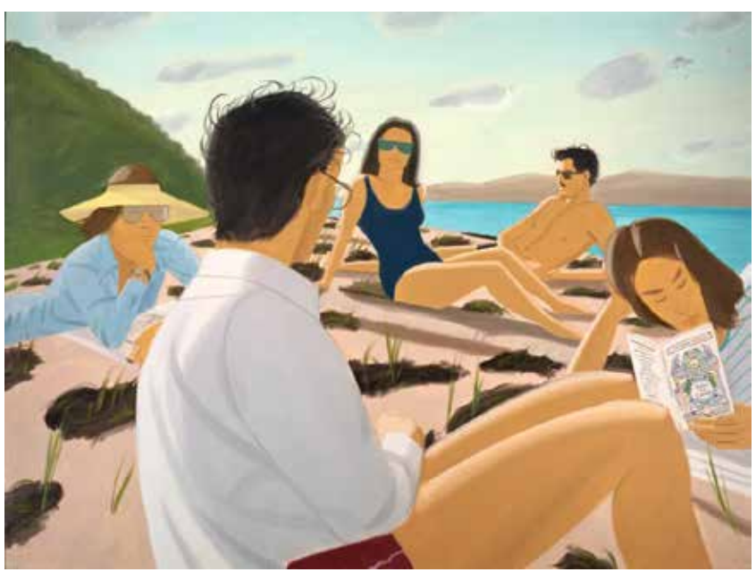
"Round Hill," 1977. Art work © Alex Katz / ARS; Photograph © Museum Associates / LACMA

contrast, profiteering digital sideshows put art to death.