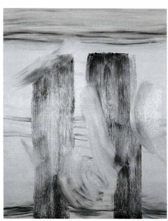
Opposite: Martha Diamond, Reflections, 1989, oil on canvas, 89½ × 60". Above: Martha Diamond, World Trade, 1988, oil on canvas, 72 × 60".

It's as if Diamond has put the paint back in front of the picture where de Kooning had it, and from where Katz eventually (and other '60s reductivists, generally) smoothed it away. But, like Katz's, Diamond's art is distinguished from that of the exemplars of action painting by a