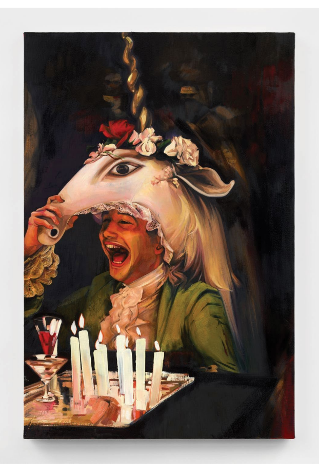
"Wolfgang," 2020. Oil on linen.

and reimagine Eyes Wide Shut aboard the sinking Titanic ?" That was my initial plan. It seemed a good idea to bring the orgy out from behind closed doors and into first-class aboard James Cameron's sinking ship and see what effect that had on my imagination. Both movies leave a residue on my memory from when I first saw them as a teenager. Combining the two films felt very 2020 in a way—like, the party was really, really , fun, and then all of a sudden, it's all just going down the drain. Then I wondered, "What other characters would it make sense to bring into this orgy at sea? Who else should be there?"