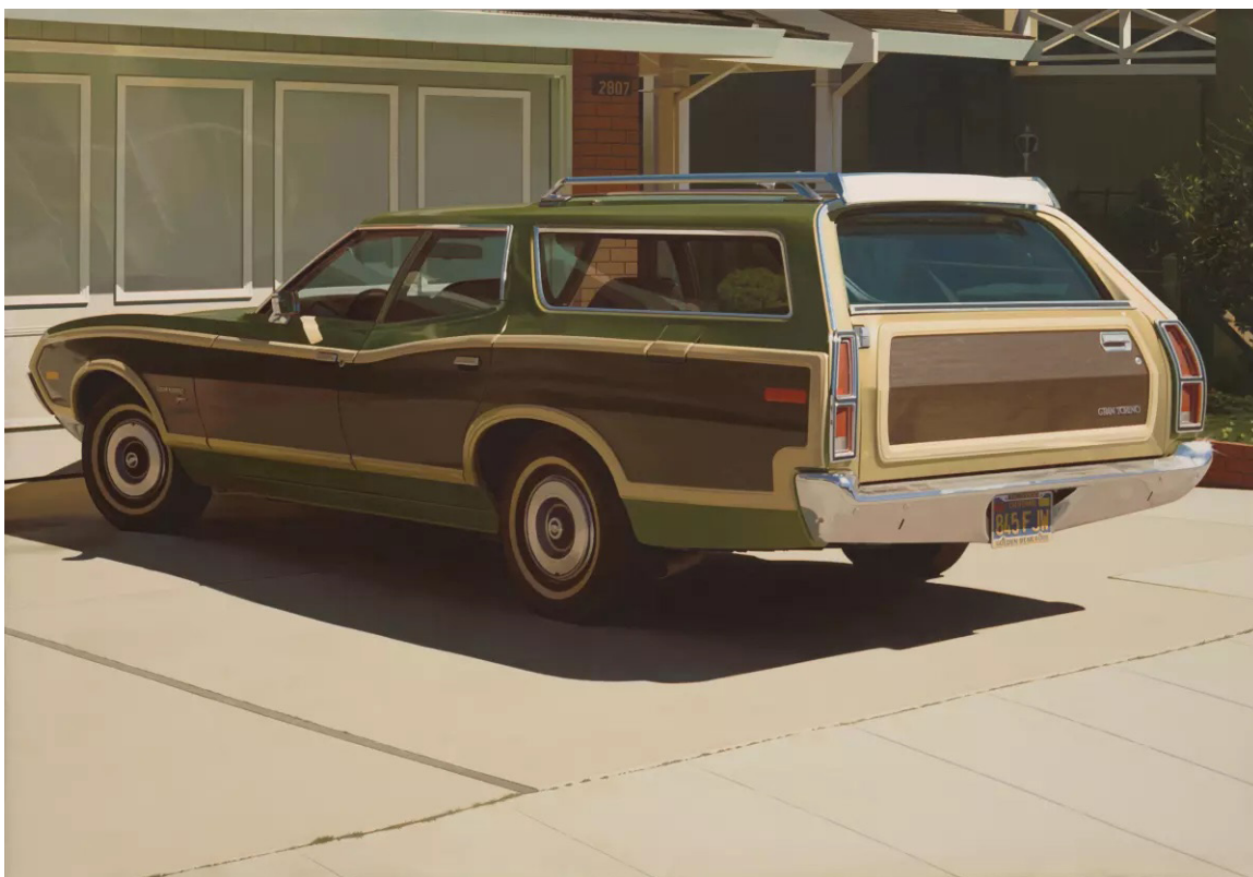
Robert Bechtle, "Alameda Gran Torino," 1974; oil on canvas. (San Francisco Museum of Modern Art)