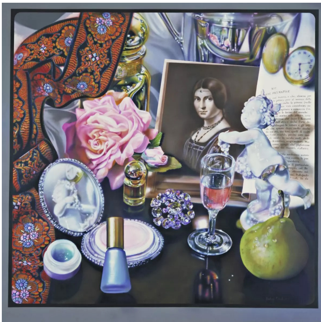
Audrey Flack, "Leonardo's Lady," 1974; oil and synthetic polymer on canvas.