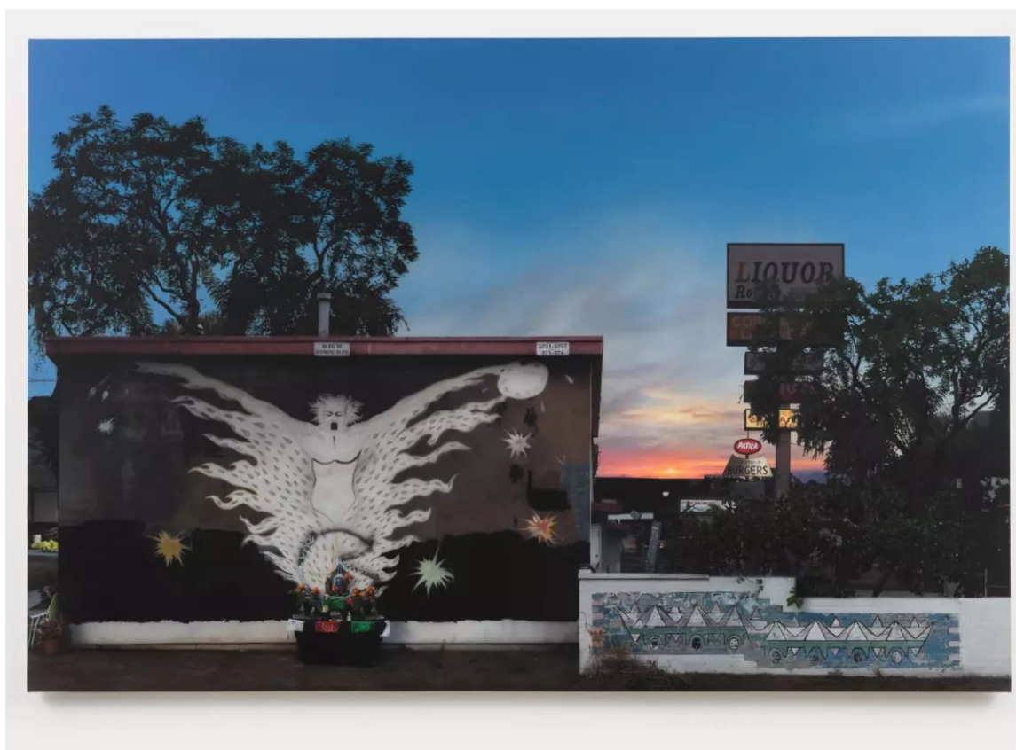
Sayre Gomez, "2 Spirits," 2024, acrylic on canvas.

Nonfunctional hyperrealism, yes; Photorealism, no.